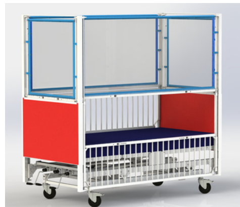
Shown with custom color Red laminate.